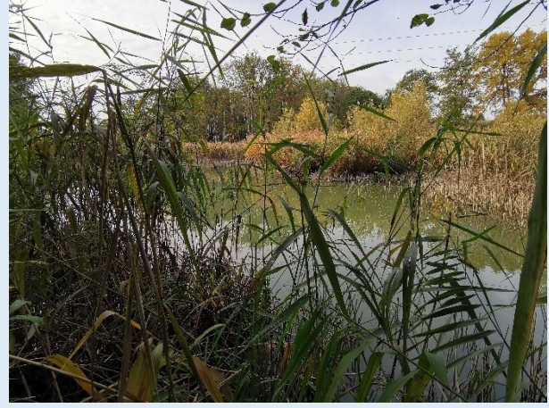
Figure 6: Pond in the Natura 2000 site.