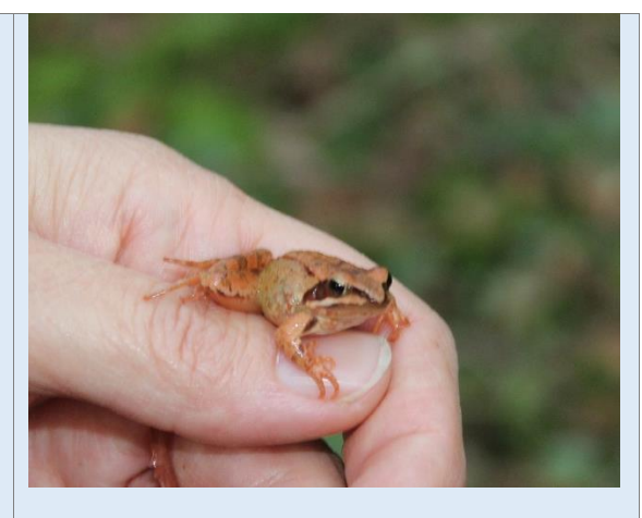
Figure 7: Juvenile agile frog.