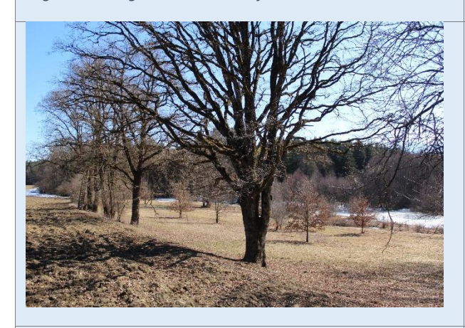
Figure 8: Old oak trees on the edge of the Natura 2000 site.