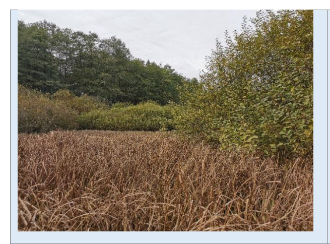
Figure 5: Large sedge swamp, willow bushes and the forest edge at the Ziegelteich Hörtendorf.