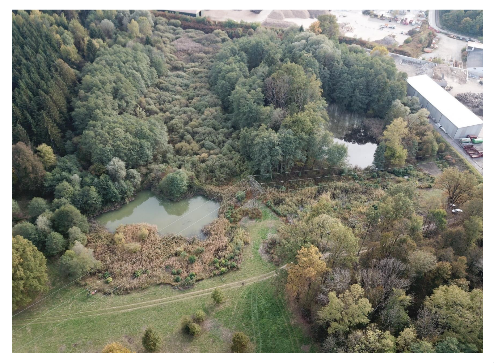
Figure 1: The Natura 2000 site around the Ziegelteich represents a steppingstone biotope in the otherwise anthropogenic landscape.