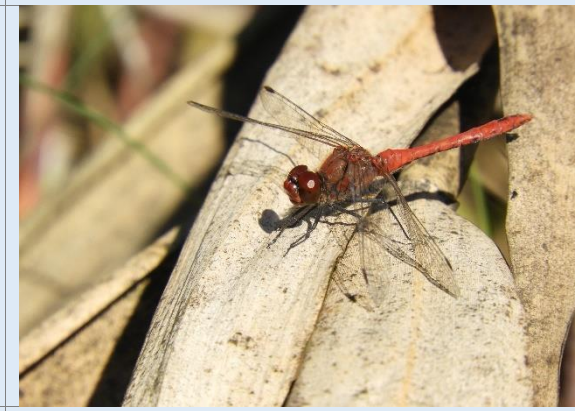
Figure 16: The ruddy darter frequents moorland waters.