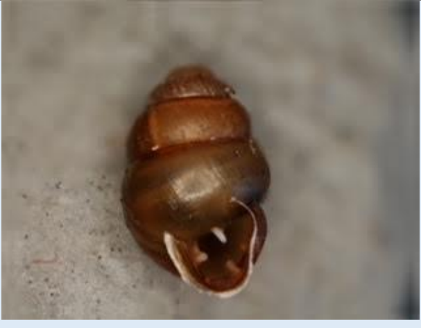
Figure 12: The Desmoulin's whorl snail is tiny and hard to spot for the laypeople.