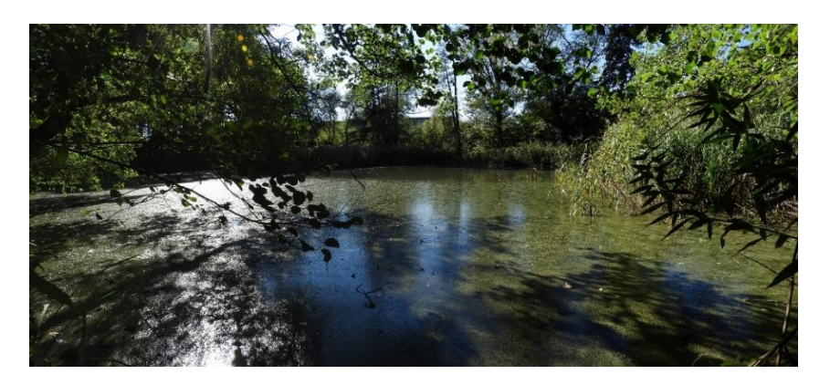
Figure 3: The eponymous Ziegelteich (brick pond).

The most important protected species is the European priority-protected Desmoulin's whorl snail (Habitats Directive Annex II), which feeds on algae turf on the marsh plants. This tiny, rather immobile animal is particularly dependent on continuous soil moisture.