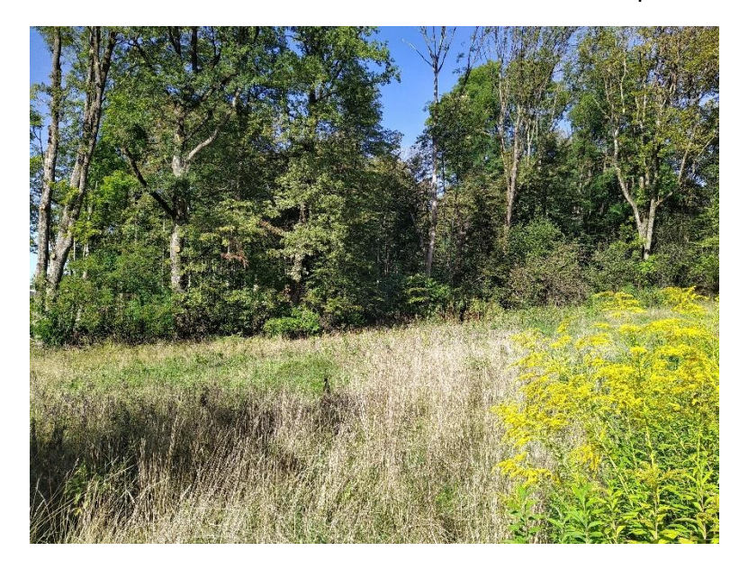
Figure 4: Invasive species such as goldenrods are increasingly invading the area and threatening the biodiversity of the meadows. The Moor4Klagenfurt biodiversity project is implementing appropriate maintenance measures.

The greatest challenge for management is to find the right level of maintenance to keep the areas open and yet preserve their small-scale, natural character. Current threats are climate change combined with increasing drought and the impending loss of old trees in connection with ash dieback. Another challenge is the strong growth of invasive species, which have been able to spread due to the abandonment of maintenance of these areas in the past.