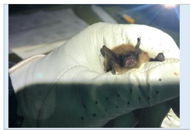
Figure 17: The Brandt's bat favours woodland areas