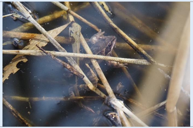
Figure 15: Male agile frog.