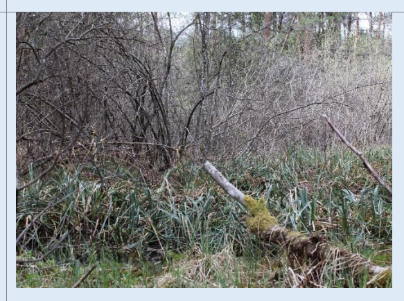
Figure 10: Willow carr, Cladium mariscum und large sedge swamp cover for amphibians in summer.