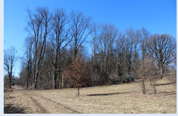
Figure 9: Valuable old trees at the edge of the forest.