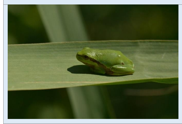
Figure 14: A large population of tree frogs is a special feature around the Hörtendorf Ziegelteich.