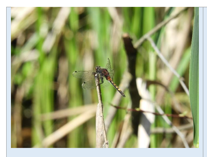
Figure 11 Male specimen of the large white-faced darter.