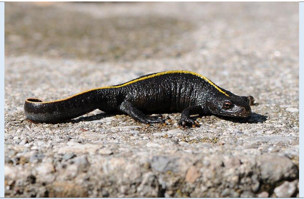
Figure 18: The Italian crested newt is found in climatically favoured valley locations and requires fish-free spawning waters.