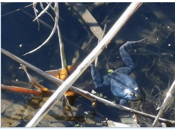
Figure 19: The male Balkan moor frogs are coloured turquoise-blue for a few days during the mating season.